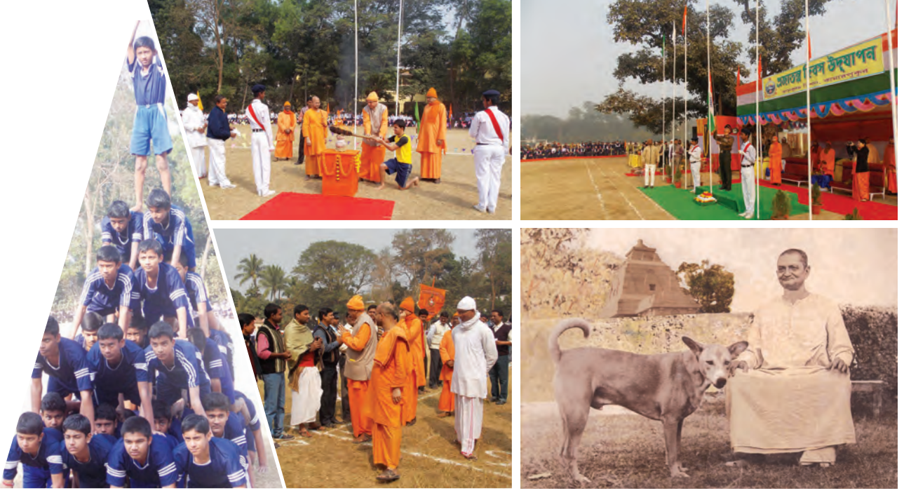
Swami Saradeswaranandaji Maharaj

This school is not only conceived as a mere academic institution but rather as a movement for imparting character-building education and helping students to inculcate the fundamental values of truth, purity and unselfishness in the students. This institution inspires the students to crystallize one of Swami Vivekananda's visions – "a glorious India of the future".