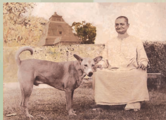
Swami Saradeswaranandaji Maharaj