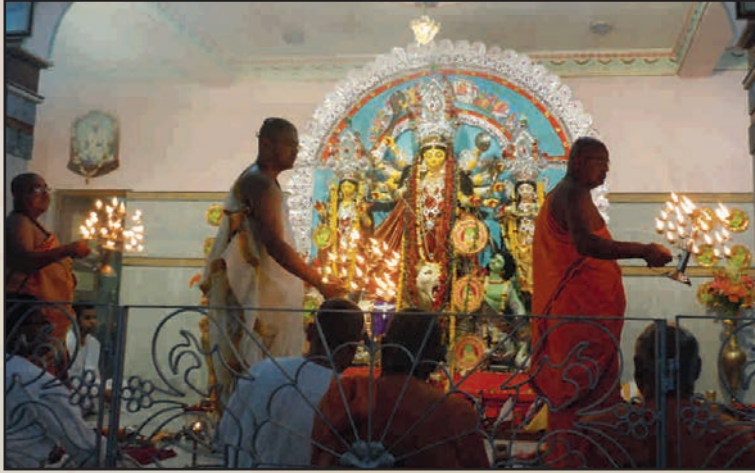
SRI DURGA PUJA