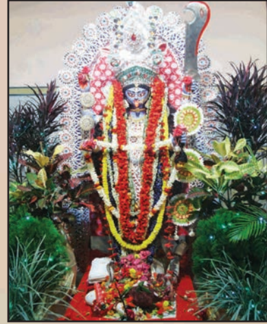
SRI KALI PUJA