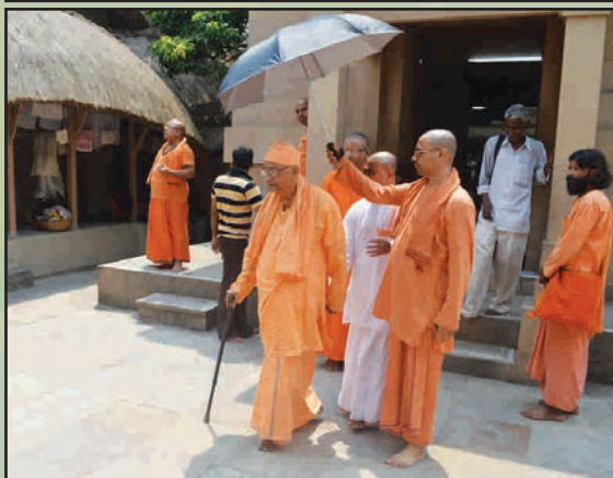
MOST REVERED VICE-PRESIDENTS MAHARAJ