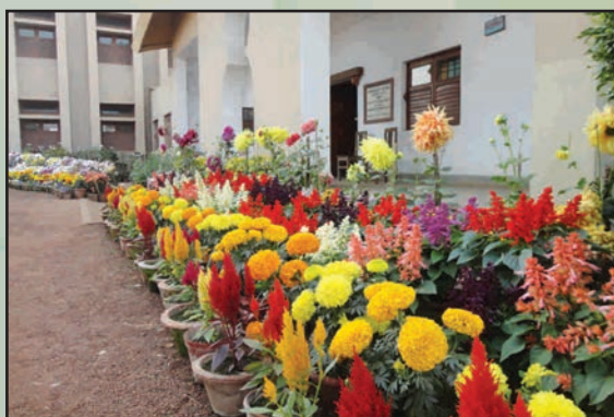
YATRI NIVAS (GUEST HOUSE)