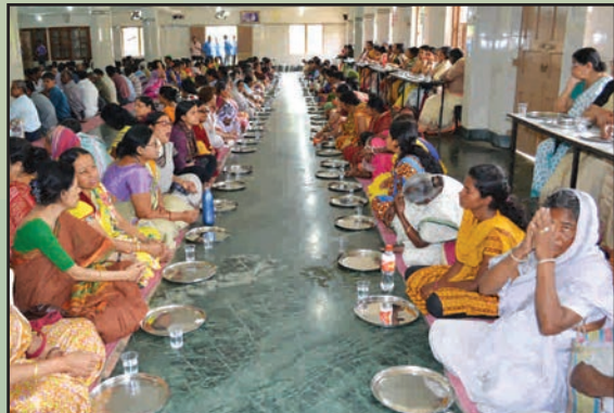
MAKING & DISTRIBUTION OF PRASAD