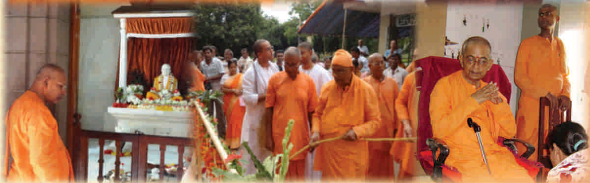
MOST REVERED VICE PRESIDENTS MAHARAJ