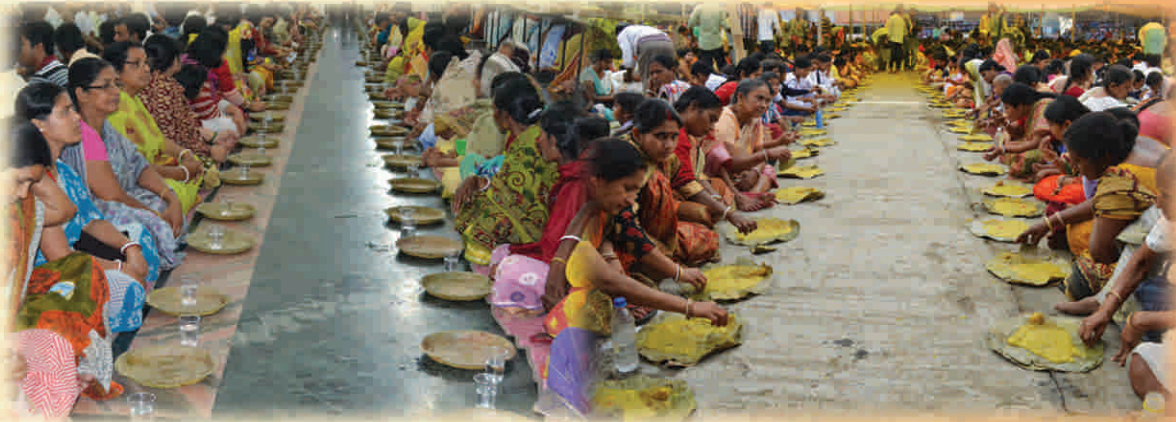
DISTRIBUTION OF PRASAD