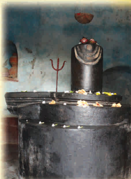
SRI GOPESHWAR SHIVA

Holy Kamarpukur, Jayrambati and Belur Math, together form the Golden Triangle of pilgrim centres. Every devotee or admirer of Sri Ramakrishna aspires to visit these three sacred places at least once in a lifetime to offer homage to the Holy Trio.