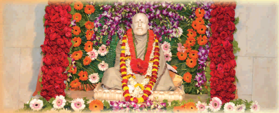
SRI RAMAKRISHNA IN THE TEMPLE