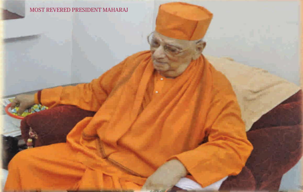
MOST REVERED PRESIDENT MAHARAJ