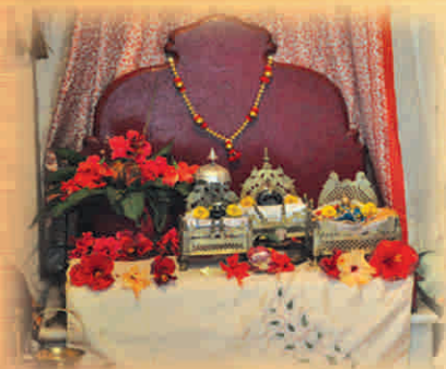
INSIDE THE SRI RAGHUVIR TEMPLE