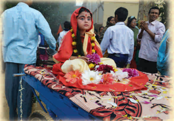
SRI THAKUR'S TITHI PUJA - THE PROCESSION