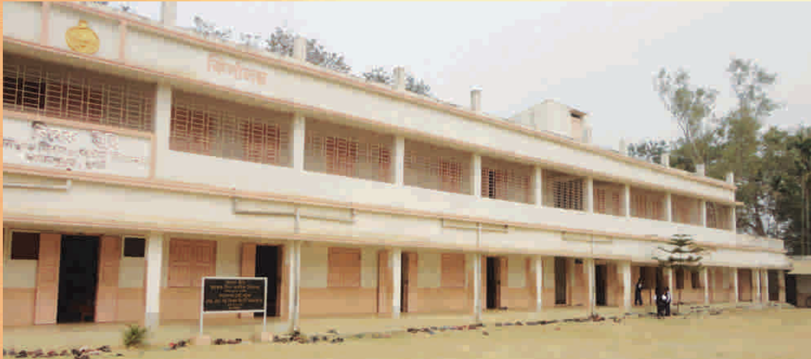
“Vivek Bithi” (Ramakrishna Mission Primary School, Kamarpukur)

“Vivek Bithi”, a primary school was inaugurated on 31 January 2010 in commemoration of the 175 th Birth Anniversary of Sri Ramakrishna Paramahansa and began its regular classes on and from 10 March, 2010. The new building of the primary school was inaugurated in 2011 and the 1st floor was completed in 2014. The aim and objective of this institution is to impart Man-making and character-building education to the students of Kamarpukur and its adjacent villages. This school also takes special care of the students belonging to socially deprived & economically backward groups. The total strength of the student is 179, where boys are 159 & girls are 20 in number.